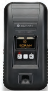
SCRAM Remote Breath®