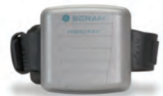
SCRAM House Arrest®